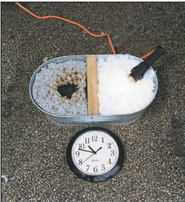
After 47 minutes: The combustion of the cellulose spread to the wood divider. There was still no effect on the InsulSafe.