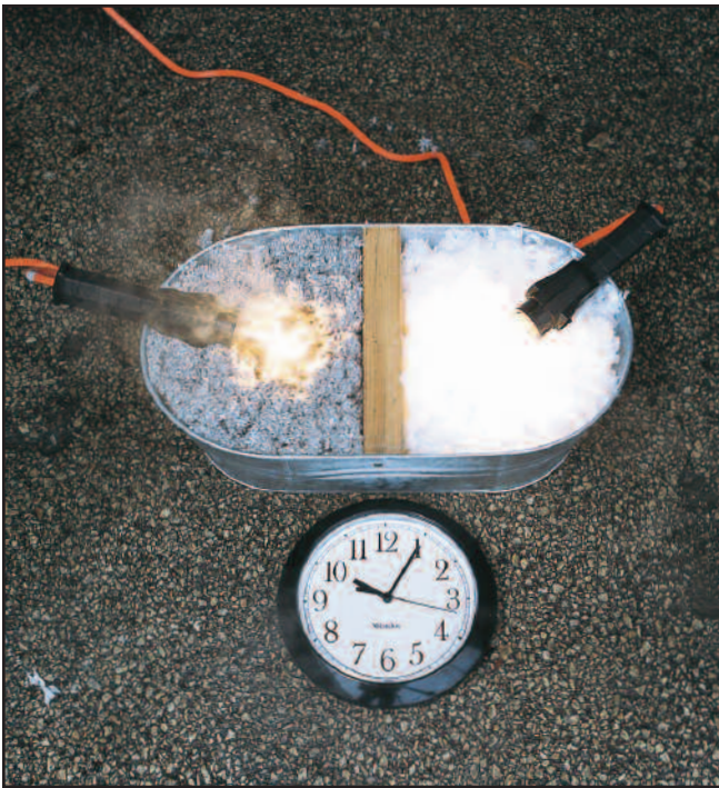
After 5 minutes: Smoldering combustion had begun in the cellulose side. There was no effect on the InsulSafe.