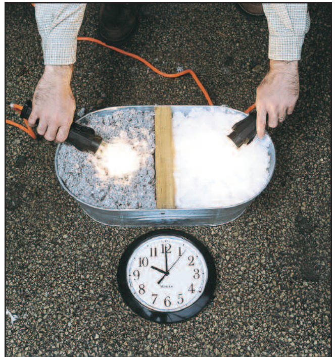
Start: Trouble lights, with a 60 watt bulb, placed on the insulation.

Perhaps most importantly, this test questions whether the compromise in safety is worth the cheaper price of cellulose. As you'll observe, cellulose makers' claim of fire resistance simply goes up in smoke. CertainTeed loose-fill insulation's claim of fire protection is, however, fireproof.