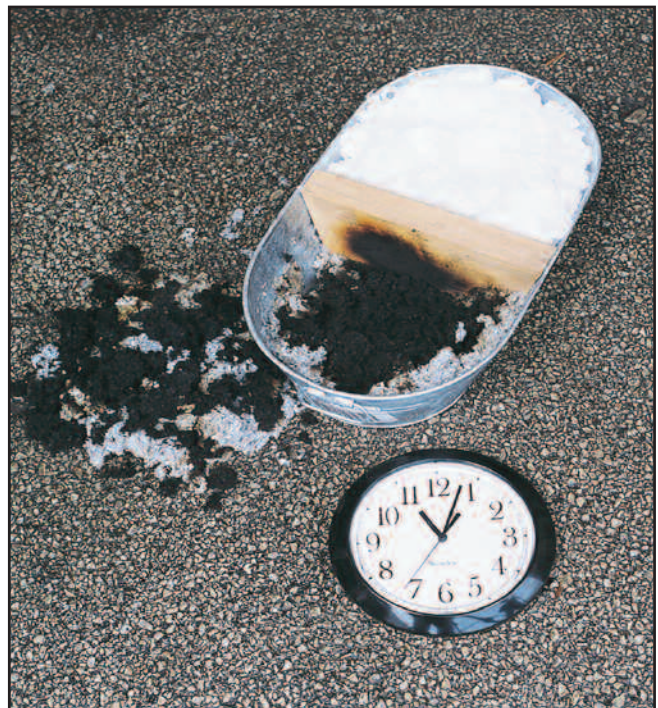
After 60 minutes: Combustion had consumed most of the cellulose, causing significant damage to the wood. Again, no effect on the InsulSafe.